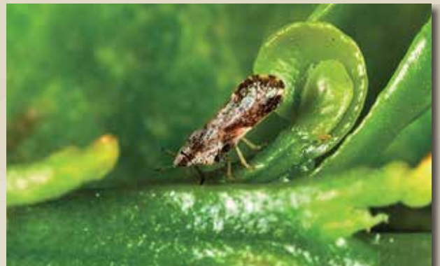
Asian Citrus Psyllid