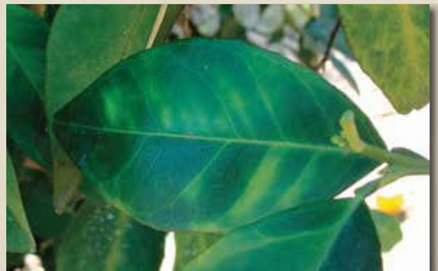
Classic blotchy mottling caused by Asian Citrus Greening